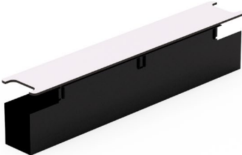
Device Box The device box consists of a technology tray, cover and cable fixation. Plugs and cables can be stored in the technology tray and disappear under the cover.

whether equipment is to be changed frequently and connections must be easily accessible. Device box, device inlay and device top can be equipped with different connection modules.