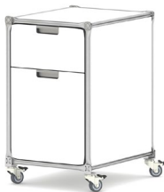
Smart Container #39905 W/H/D: 41/66/48 cm 1 drawer, 1 door, 1 back panel, casters Ø 50 mm

The standard castors ensure unlimited mobility and adjustable feet are optionally available. Our Smart Container, also on castors, offers storage space for writing utensils, office supplies and personal items.