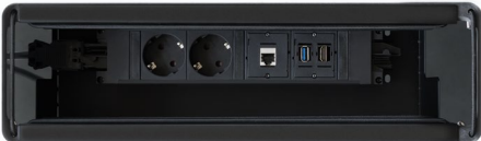
Socket strip IN Free · 2 safety plugs · 2 freely assignable modules (here: 1 slot USB 3.0, HDMI 2.0 and RJ45 CAT6) · Current input: GST18; current output: GST18 · Cable length: 3 m · Black plastic body