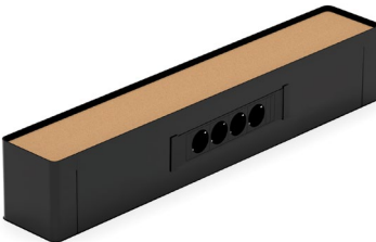
Device Top The device top is placed on the device cutout. The body made of black powder-coated steel forms a zoning on the table surface and carries technology modules on both long sides. The upper end of the attachment offers a practical pen tray.