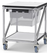
Sitting container SitRack #65731

White honeycomb tabletop with black edge, folding frame, casters Ø 75 mm optionally on adjustable feet