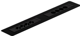
Device Inlay The device inlay is inserted flush into the technology cutout. The connections can be fitted as required and are easily accessible for use.