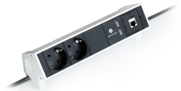
Technical connection ON