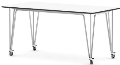
Table BridgePro S with W/H/D: 144/76/72 cm Table BridgePro M with W/H/D: 162/76/81 cm Table BridgePro L with W/H/D: 180/76/90 cm Table top 16 mm with black edge, castors Ø 75 mm, optionally on adjustable feet

BridgePro is the elegant all-rounder for the office and at home. Instead of the Bridge table's distinctive zigzag crossbars, the BridgePro uses slim steel profiles. These provide more legroom under the table and space for a mobile container.