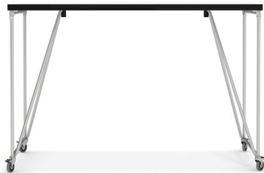
Standing table RackPod H

And when they are not needed, they can be stored in a space-saving manner in just a few steps thanks to the folding frame. The RackPod tables are particularly well-suited to situations where you need a minimalist design combined with flexibility and mobility.