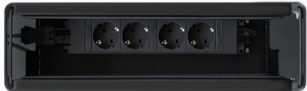
Socket strip IN Start · 4 safety plugs · Current input: GST18; current output: GST18 · Cable length: 3 m · Black plastic body