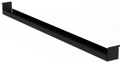
Cable trough S #38936