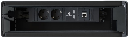
Socket strip IN USB Charge · 2 safety plugs and 1 USB double charger · 1 freely assignable module (here: RJ45 CAT6) · Current input: GST18; current output: GST18 · Cable length: 3 m · Black plastic body