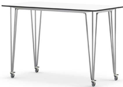
Standing Table BridgePro S with W/H/D: 144/107/72 cm Standing Table BridgePro M with W/H/D: 162/107/81 cm Standing Table BridgePro L with W/H/D: 180/107/90 cm Table top 16 mm with black edge, castors Ø 75 mm, optionally on adjustable feet

The standard castors ensure unlimited mobility and adjustable feet are optionally available. Our Smart Container, also on castors, offers storage space for writing utensils, office supplies and personal items.