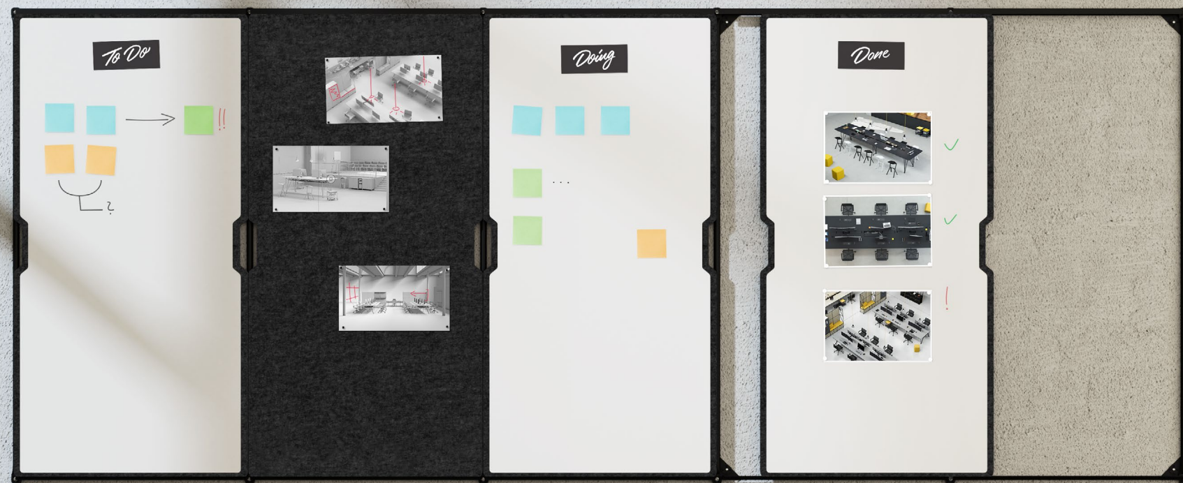
The WallRail Pro is mounted on the wall and can be extended as required.