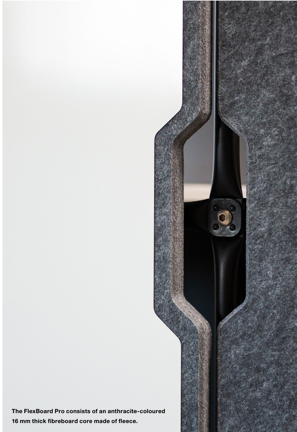
The FlexBoard Pro consists of an anthracite-coloured 16 mm thick fibreboard core made of fleece.