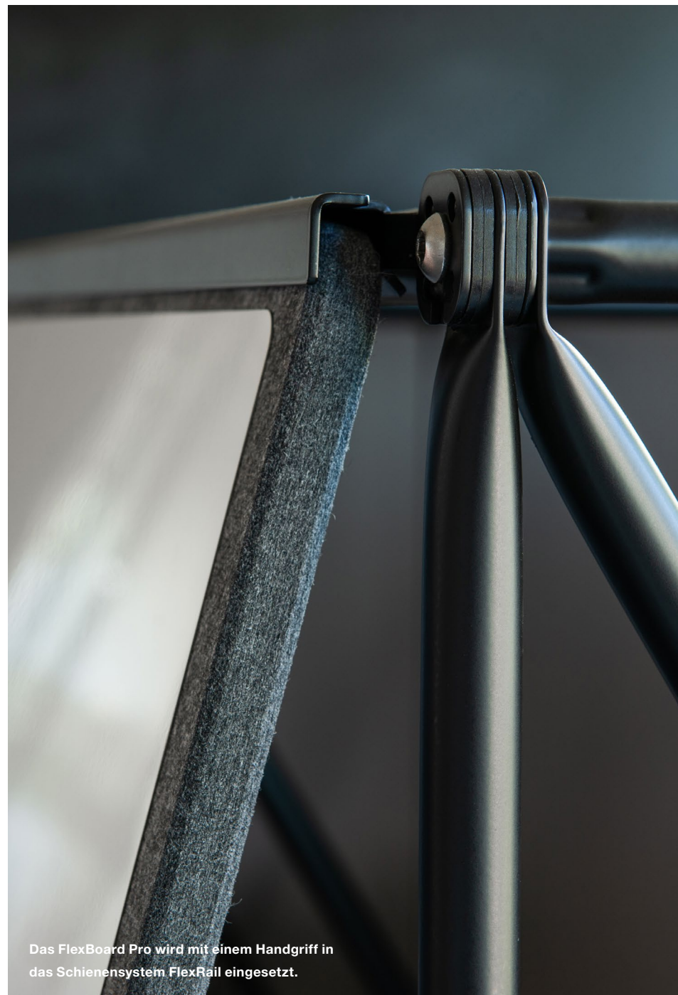
Das FlexBoard Pro wird mit einem Handgriff in das Schienensystem FlexRail eingesetzt.