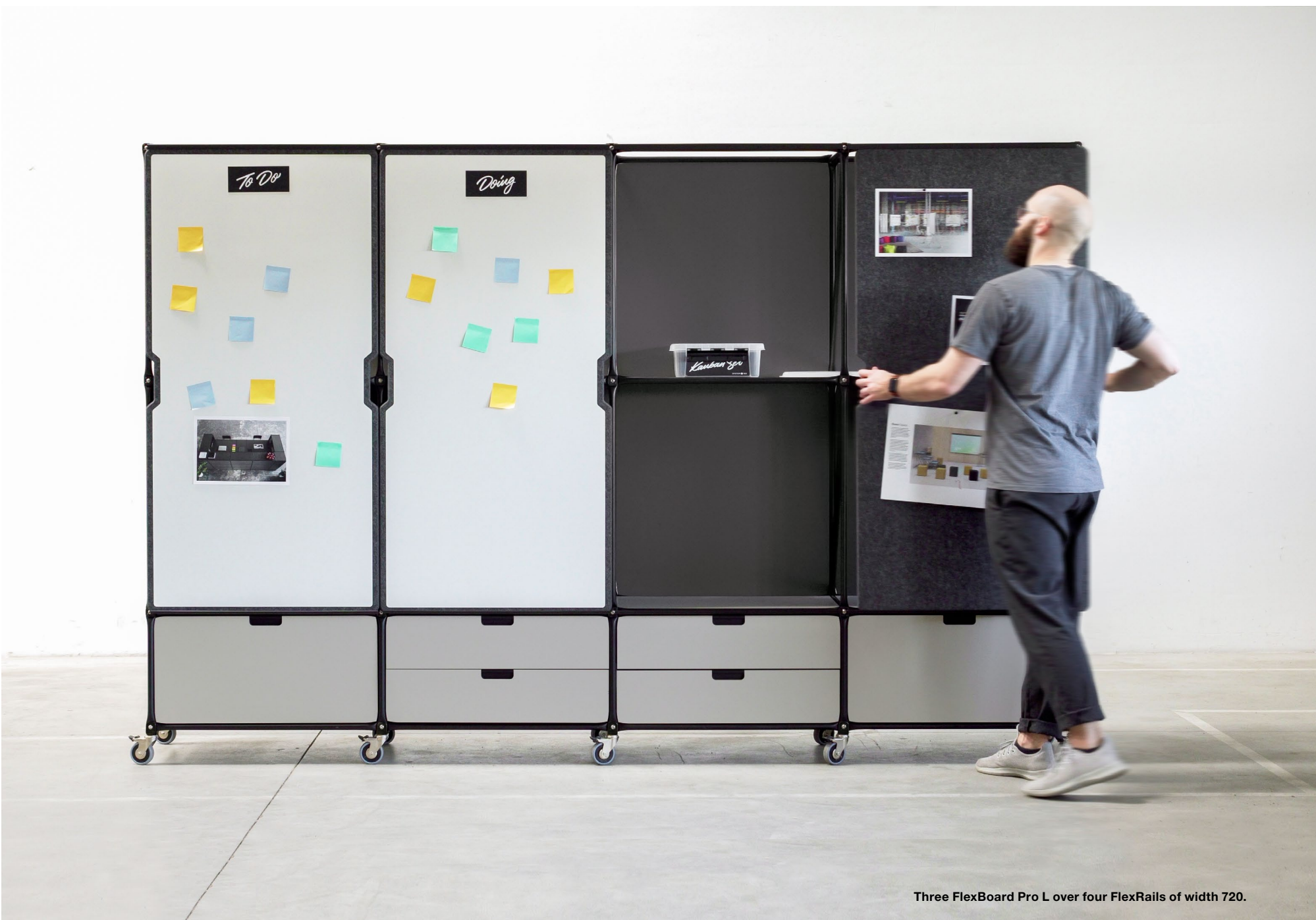
Three FlexBoard Pro L over four FlexRails of width 720.