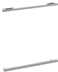
WallRail Pro 2.0 - Grundmodul S/M #78861

Rail profile set for the installation and use of FlexBoard Pro. Available in the widths 360 (# 70769), 450 (#70759), 540 (#70749), 630 (#70739), 720 (#70590), 810 (#70719), 900 (#70729). · optional in BlackLine