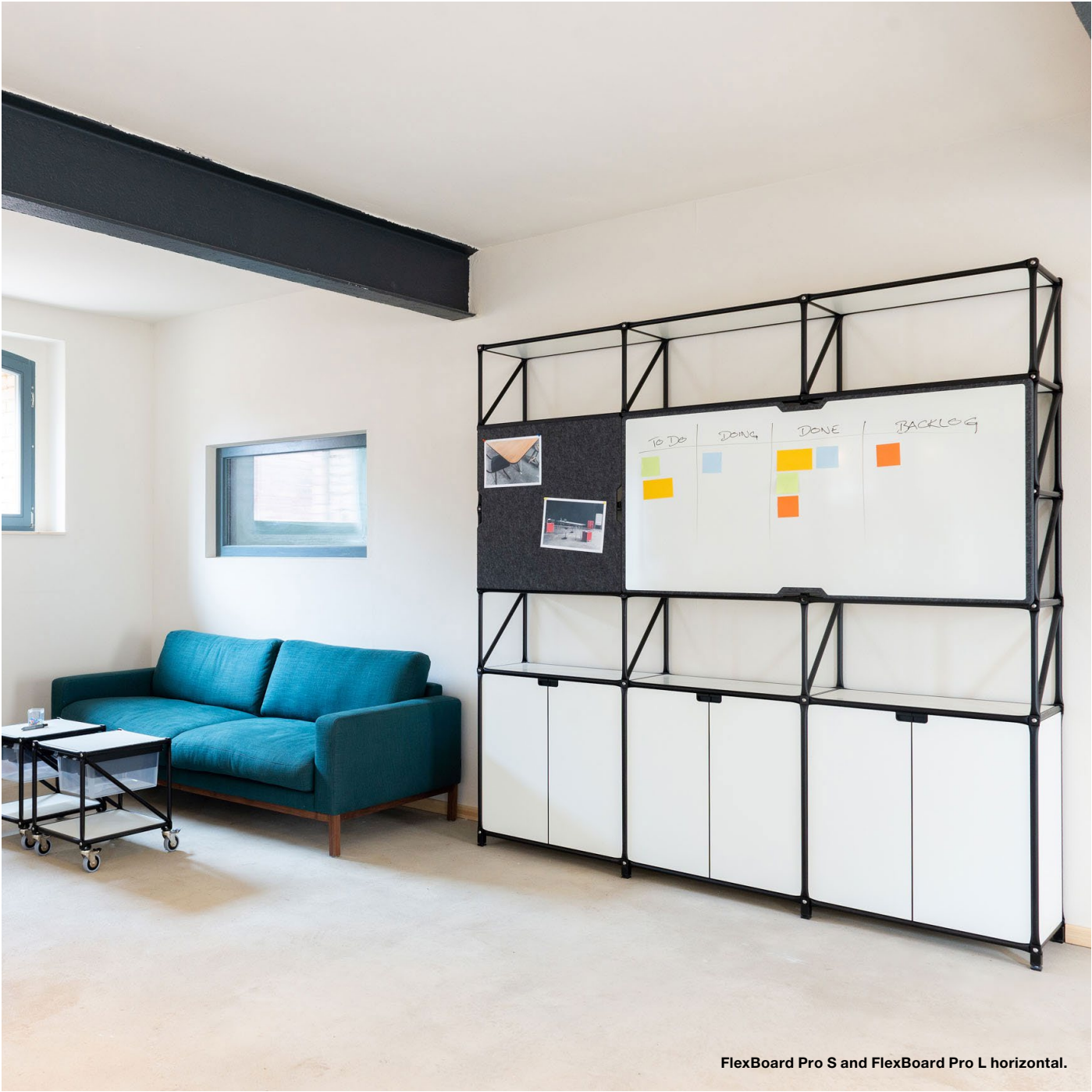
FlexBoard Pro S and FlexBoard Pro L horizontal.

W: 72 cm Wall mounted storage for up to 4 FlexBoard Pro · optional in BlackLine