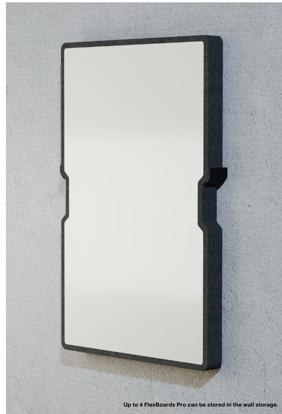
Up to 4 FlexBoards Pro can be stored in the wall storage.