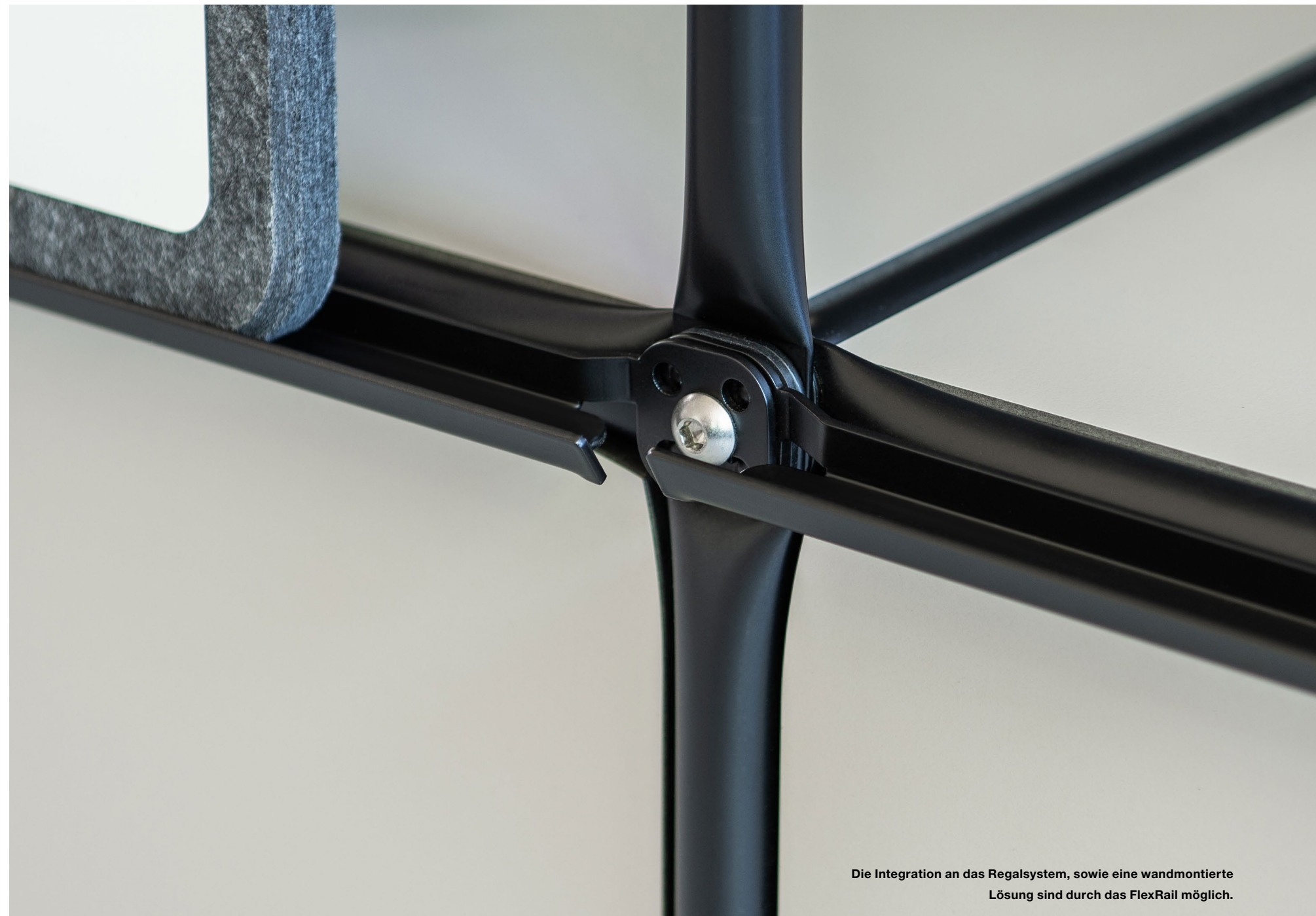
Die Integration an das Regalsystem, sowie eine wandmontierte Lösung sind durch das FlexRail möglich.