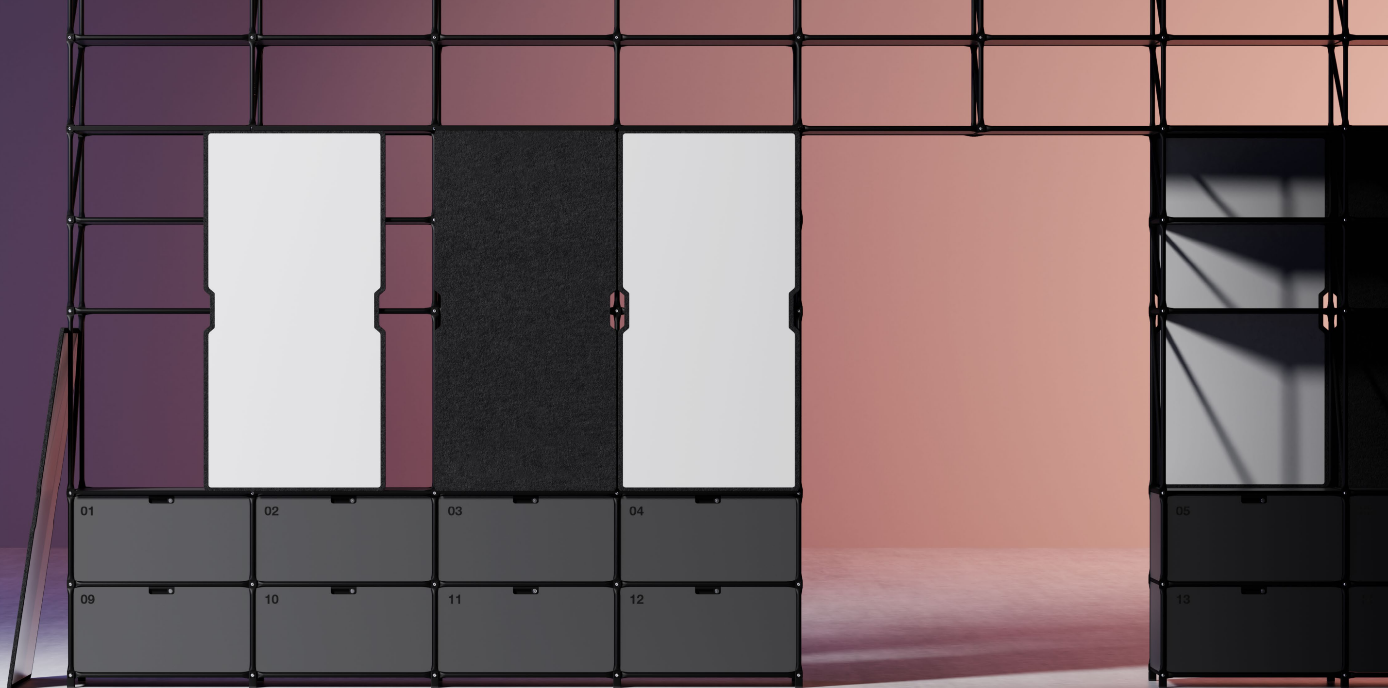
FlexBoard Pro L on one of our room dividers with locker system.